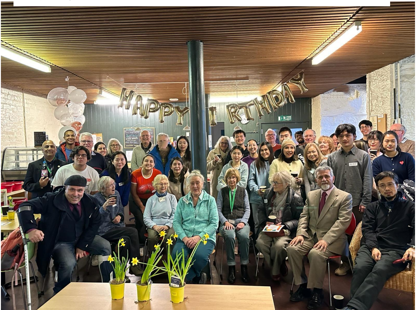
The Conversation Corner members who attended the 10th Birthday celebration.

More than 50 people chatted at the café tables for the first part of the event. Hosts/Hostesses/ NESSIEs (Native English Speakers Sharing Information and Experience) and their Guests – the internationals who want to practise the English they know at the level they are most comfortable with - talked about anything and everything.